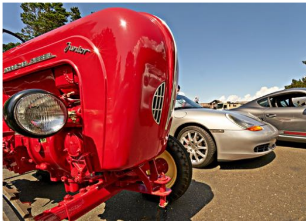
SALISHAN CHARITY PORSCHE SHOW – CENTRAL 2