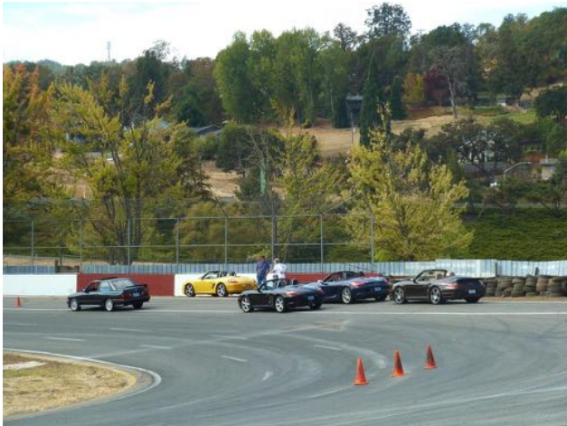
DRIVERS SKILLS CLINIC – CENTRAL CHAPTER 3

More Pictures & Content may be found at www.cascadeporscheclub.org