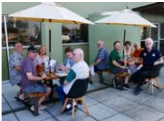
DINING AL FRESCO IN MEDFORD 1

More Pictures & Content may be found at www.cascadeporscheclub.org