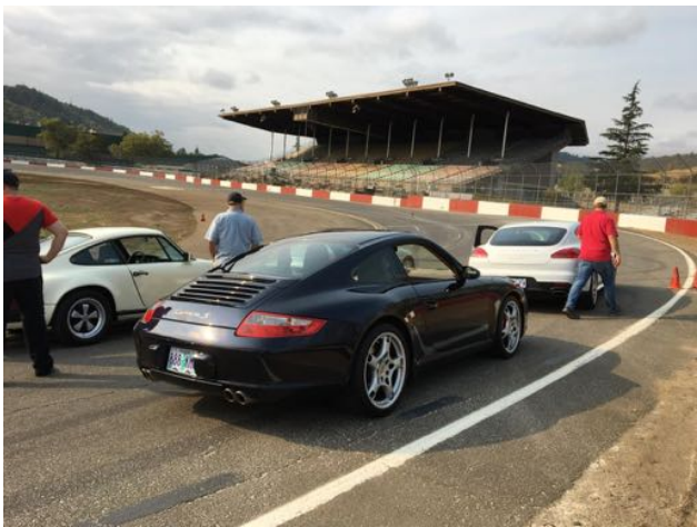
DRIVERS SKILLS CLINIC – CENTRAL CHAPTER 2