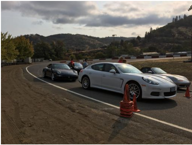
DRIVERS SKILLS CLINIC – CENTRAL CHAPTER 1