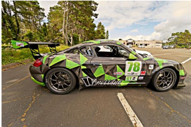
SALISHAN CHARITY PORSCHE SHOW – CENTRAL 1

Although the newsletters were sparse, both chapters of the Cascade Region were pretty busy this summer. There were loads of drives and get-togethers. Here are just a few of the events in snapshots.