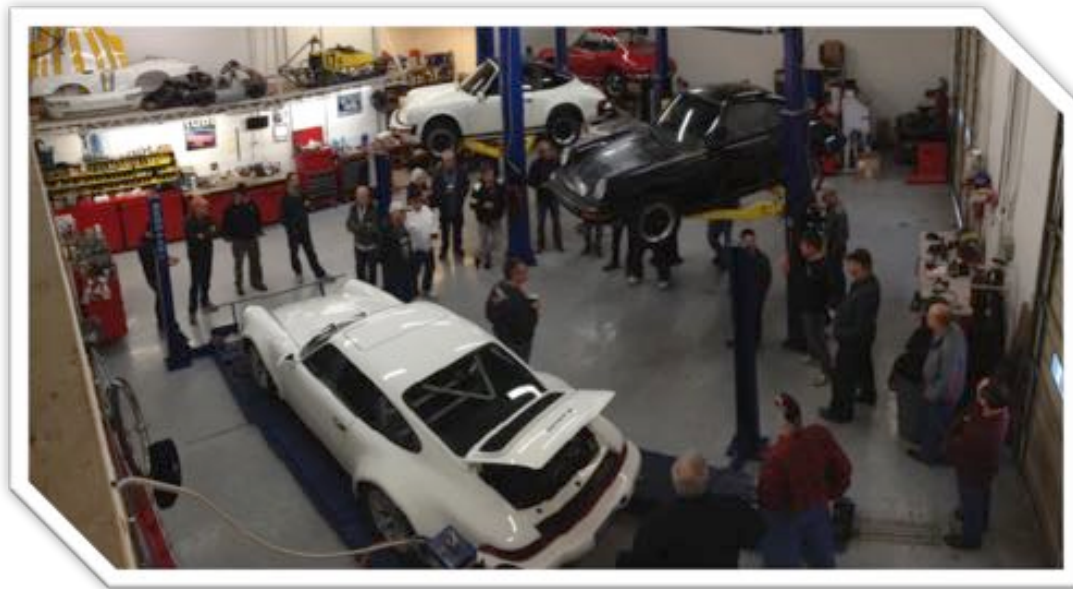
Tech Session at Central Chapter.